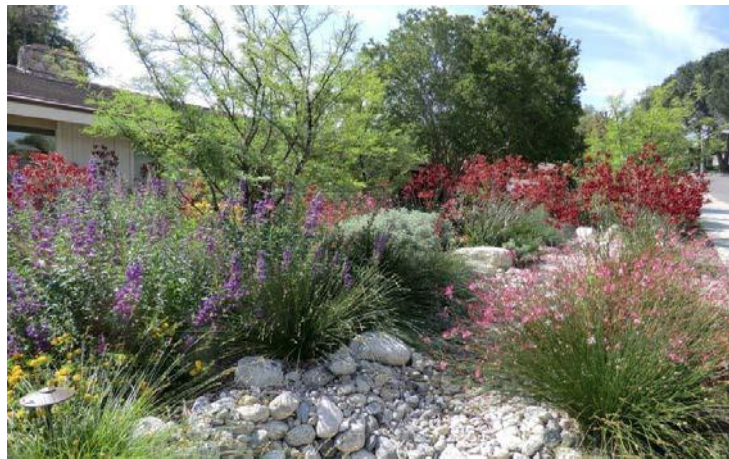
Example: California Native Garden and Bioswale