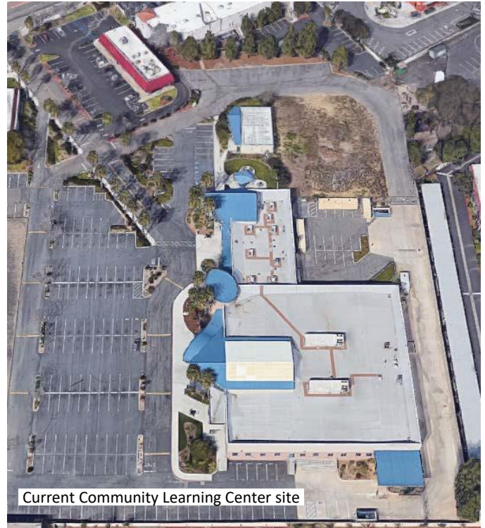
Current Community Learning Center site

View the Facilities Master Plan at www.miracosta.edu/masterplan .