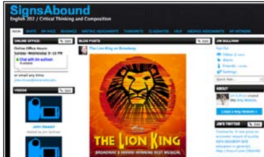
English 202 course blog.

discovering resources for research and other writing projects that they would not have discovered working alone. In short, social bookmarking is contributing to better thinking, reading, and writing in my classes.